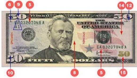
$50 Front (1996 Series)