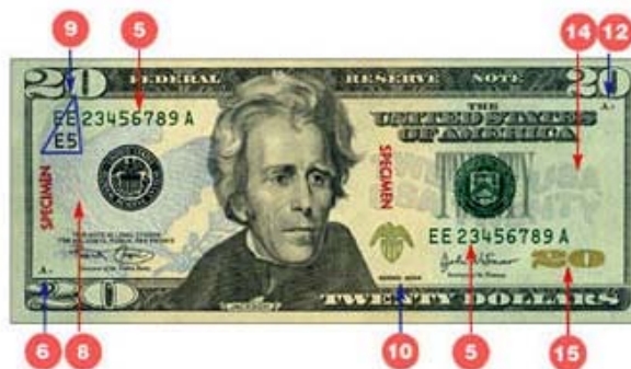
$20 Front (1996 Series)